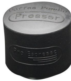
Coffee Powder Presser