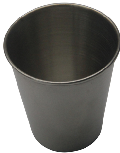
Stainless Steel Cup